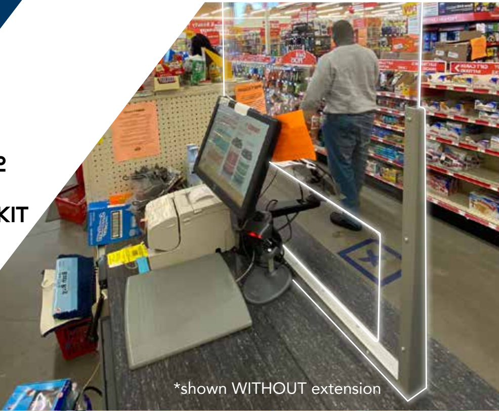
*shown WITHOUT extension

NW200300-LC3642-KIT EXTENSION BRACKET ASSEMBLY